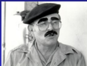
25 Years Ago