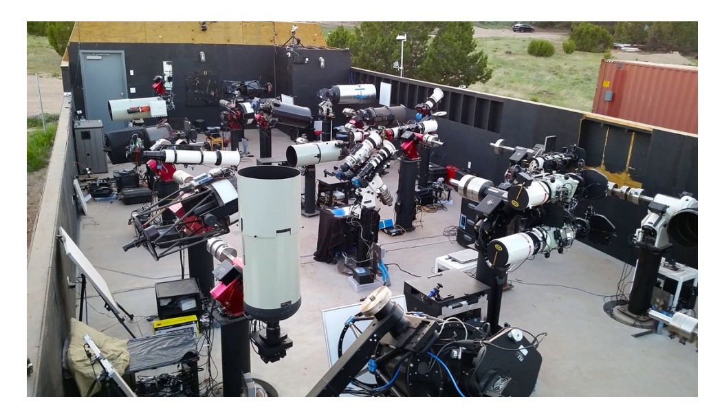
Figure 4. A view of one of the Deep-Sky West observatories in New Mexico with the roof open. All of these telescopes are remotely operated and it is quite a show as they all come to life as it gets dark each night. In this image, most of them are parked in a position to point at remotely controlled, illuminated flat panels, which are used for image calibration. (Something went wrong with that one scope in the foreground that's pointed straight up!)

nowhere! It took a while to get there, but my scope is coming up on a full year without a service visit—and it's been running every clear night.