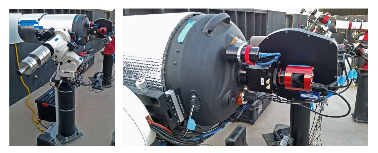
Figure 3. My custom Edge 14 HD at the Deep-Sky West Observatory in northern New Mexico. The image on the left shows the Astro-Physics 1600 German equatorial mount. The telescope itself is wrapped in Reflectix to minimize differential radiative cooling. The image on the right shows the camera, focusing, and guiding instruments. The main CCD imaging camera is out of view behind the large filter wheel holder seen behind the red CMOS guide camera. Small fans behind the primary mirror gently circulate air to prevent laminar thermal air currents inside the telescope tube.

The FLI-ML16803 scientific grade camera that I use has a 36 mm x 36 mm 16 Mpx monochrome CCD sensor with 9-micron pixels that can be cooled to -50C below ambient to reduce dark current. The camera has pre-flash capability to allow for calibration of residual bulk-imaging (RBI) that results from trapped charge leakage from the bulk silicon at low temperatures. Colors are obtained by imaging through precision thin-film color filters—typically luminous (L) and RGB filters along with 3 narrowband filters centered on specific bright spectral lines for hydrogen alpha, triple ionized oxygen and doubly ionized sulfur. I typically use 1200 second sub-exposures to make sure that read noise (~ 9e-) is well below other noise levels. A typical image might be processed from a combination of well over 100, 1200 second sub-images taken over many sessions. When you add up all of the additional calibration images that go into creating a single 6 MB image, there might be 3-5 GB of image data involved.