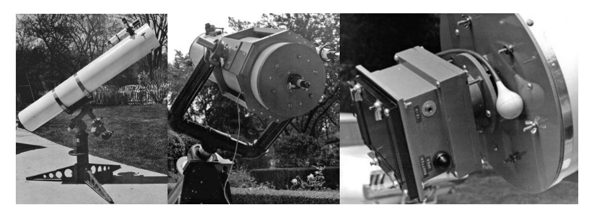
Figure 1. (Left) My first 8-inch Newtonian that I built in the mid-'60s. (Center) The 12.5-inch Newtonian/Cassegrain that I built a couple of years later. (Right) The 4 x 5-inch camera that I made. It was so difficult to use that it never saw much use. Focusing was a significant challenge. (I probably shouldn't admit it but I still have most of this old stuff!)

We had rooms dedicated to grinding and polishing mirrors, and I quickly bought an 8-inch mirror kit—for about $15. It came with a Pyrex mirror, a glass tool, all of the grades of abrasives for grinding and polishing the mirror and a couple of blocks of pitch for making the polishing lap. I must have spent six months working on that mirror before I was ready to polish the figure. I learned about how to measure the radius of curvature and how to use a knife-edge tester. That mirror eventually ended up in a telescope that I used to take my first astro-photos. It was back in the days of film so I built a little dark room in our basement where I taught myself how to process and print my first images. All of my images were guided by hand so none of them were very good, but I loved the challenge and I had a ball. I eventually built a 12.5-inch Newtonian-Cassegrain telescope and a camera that I used for lunar imaging.