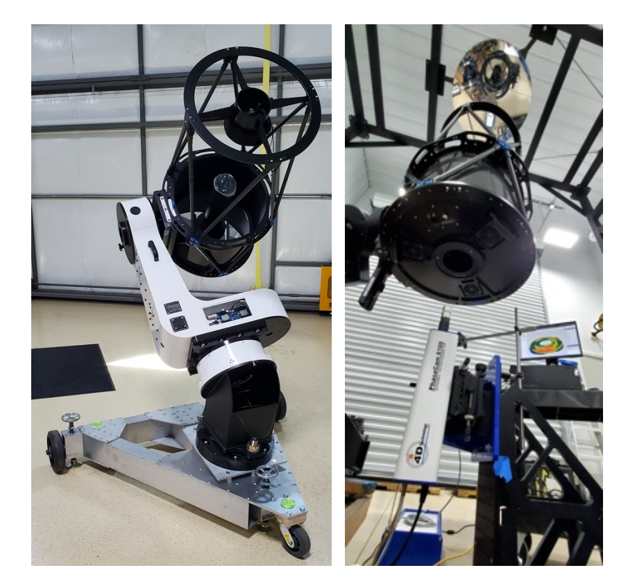
Figure 5. (Left) My new 20-inch Planewave CDK telescope in my shop in Oregon on a homemade roll-out base for initial testing. The base wedge is set for the latitude of the observatory in Chile so there's an additional compensator wedge to allow polar alignment in Oregon. The whole assembly weighs about 700 lbs. (Right) The telescope being tested at the factory in double pass against a 45-inch precision Zerodur flat with a PhaseCam 6100 Dynamic interferometer.

bigger than the 14-inch and the signal from the 20-inch should be about 2.5 times larger than with the 14-inch scope (for extended objects). The mount uses all direct-drive motors without gears so the slew rates are quite high (~50 deg/sec) and it runs without backlash or periodic errors. Stand back when this thing is running—it will knock you silly if it hits you in the head! Each axis has optical encoders with tracking accuracy better than 0.05-inch. I am attempting to have it all running in Oregon within a month, so standby for some initial results.